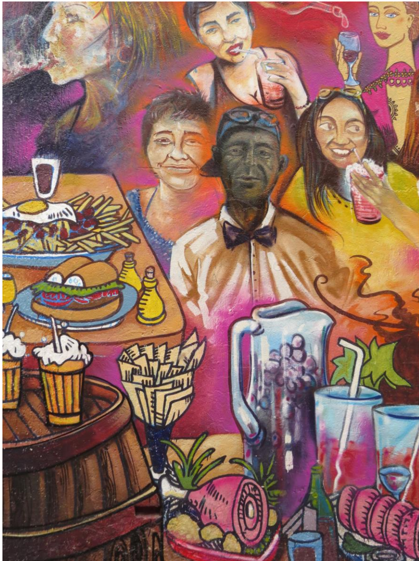
La Piojera, Santiago de Chile