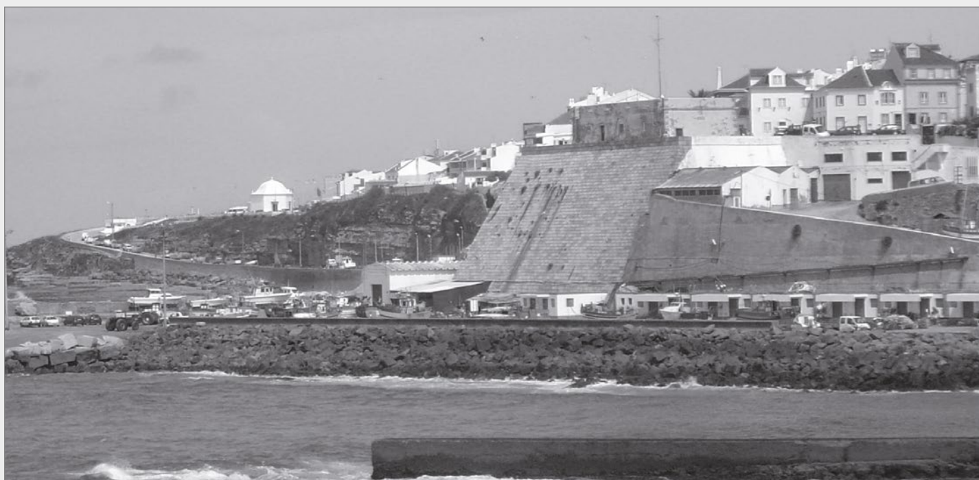
▲ Ericeira beach (2016).

Ericeira is an old fishing place, where, at least since the 12th century, whaling was practiced. It is also famous for being the port from where the Portuguese royal family left the country, after the republican revolution of 1910. Nowadays, it is an interesting nice village, that maintain part of its fishing activities and is, especially during weekends and holidays, a beach destination for people living in the surrounding areas. Many Lisbon's inhabitants have second homes there. In the last years, Ericeira has been much sought for the quality of its waves, being a World Surfing Reserve since 2011. To finish, just one small curiosity: the central plaza in Ericeira is called Jogo da Bola [Ball Game]. It had the same name when Ramalho Ortigão visited it in the end of the 19th century.